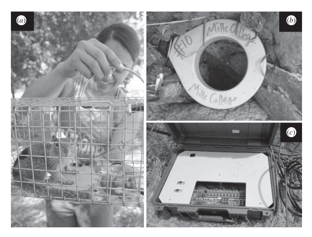
Figure 1. Novel automated-tracking system. ( a ) Live trapping and release of free-living California ground squirrels allow researchers to provide each individual with a unique fur mark for visual identification during social observations, ear tag for identification during trapping and passive integrated transponder (PIT) tag beneath the skin for detection by the monitoring system. ( b ) Movements are detected by scanning an individual's PIT tag every time it passed through a secure antenna loop inside of a burrow opening. ( c ) Data logger (Biomark, Inc., Boise Idaho) records information about the time of day, squirrels' PIT tag ID and burrow location for each movement event. (Online version in colour.)